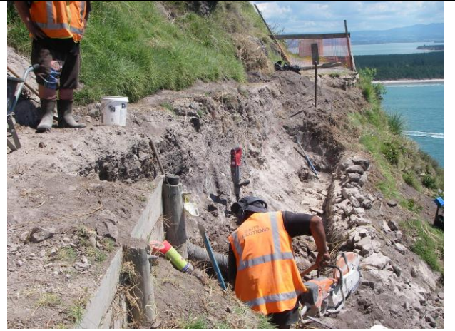
Photo 2 Oruahine Track repair work site after removal of existing track bed and slip debris. Rock substrata in process of being excavated.