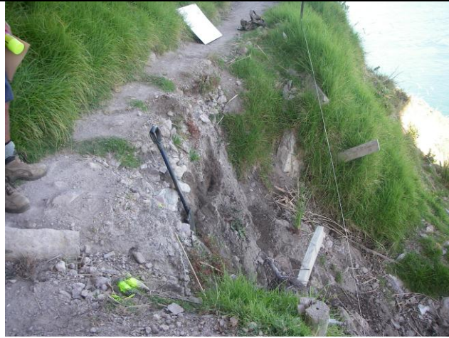
Photo 1 Oruahine Track repair work site prior to removal of existing track bed and slip debris.